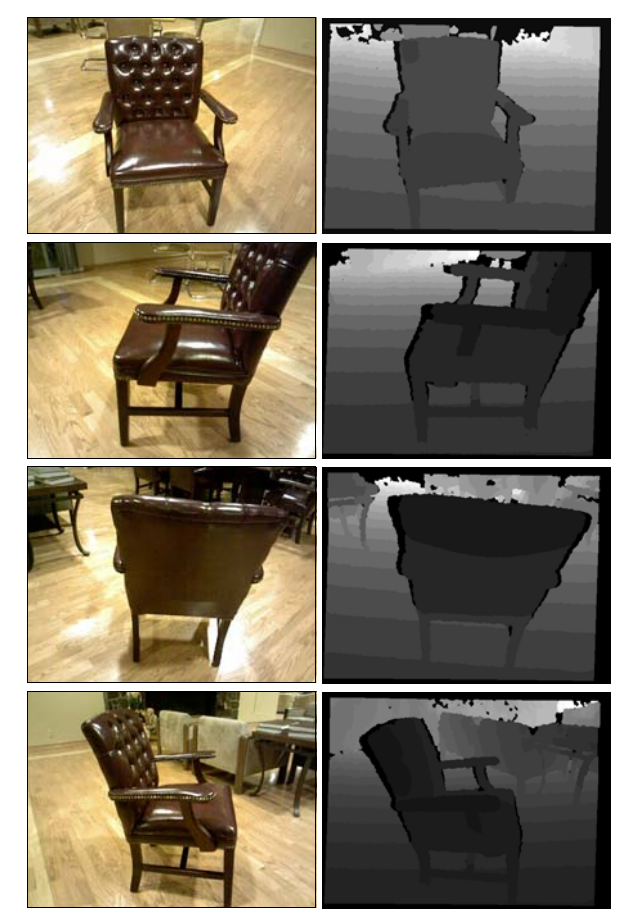
Fig. 1. The RGB images and depth maps of a chair are scanned by four Kinect sensors

where ED is the estimated measurement by a device and RD is the real known measurement of the object.